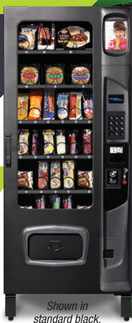
Shown in standard black.