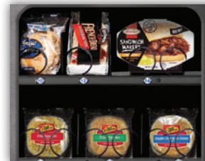
Vends all types of frozen meals, sandwiches & deserts.

In order to bring you the best products possible, we continue to improve product design and performance and as such specifications are subject to change without notice. The manufacturer makes no warranties or representations of compliance with any local, state, national or international requirements for the operation of the equipment in any application for which it is capable of being used beyond approvals listed on the product. Any purchaser is required to make an independent analysis of the fitness and legality of the product's usage before it is deployed and must continue to monitor the potential changing nature of compliance requirements. The manufacturer expressly disclaims responsibility for compliance with any laws and affirmatively requires any buyer to make an independent analysis of the fitness and legal basis of any use or application of the subject unit.