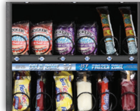
Vends all types of refrigerated & frozen meals, sandwiches & deserts.

In order to bring you the best products possible, we continue to improve product design and performance and as such specifications are subject to change without notice. The manufacturer makes no warranties or representations of compliance with any local, state, national or international requirements for the operation of the equipment in any application for which it is capable of being used beyond approvals listed on the product. Any purchaser is required to make an independent analysis of the fitness and legality of the product's usage before it is deployed and must continue to monitor the potential changing nature of compliance requirements. The manufacturer expressly disclaims responsibility for compliance with any laws and affirmatively requires any buyer to make an independent analysis of the fitness and legal basis of any use or application of the subject unit.