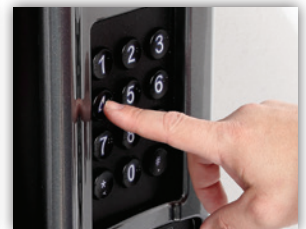
Large Keypad with Braille Identified Keys

Includes standard electronic coin acceptor and $1, $5, $10 & $20 bill acceptor (Set for $1 & $5)