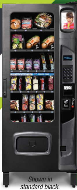
Shown in standard black.