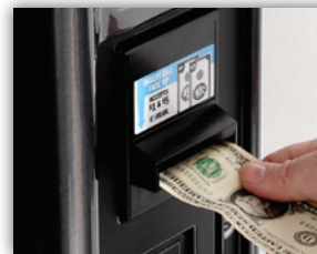
Premium Currency Acceptors

Enhances product presentation promoting more sales. No bulb servicing for 5 years. Energy efficient and eco-friendly.