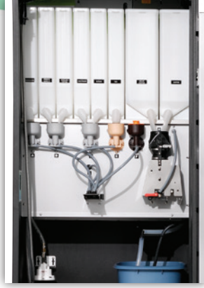
State-Of-The-Art Brewing System Simple brewing system and filtering ensure a high quality, consistent drink (No Filter Paper Required)