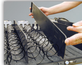
Re-configure trays to almost any package size in the field with no need for tools.