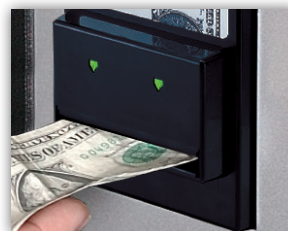
Premium Currency Acceptors

Keep your customers happy by with all their favorite chips, crackers, cookies, candy & confections.