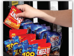
Dispenses All Brand Name Products

Keeps customers satisfied and reduces service calls for misloaded product.