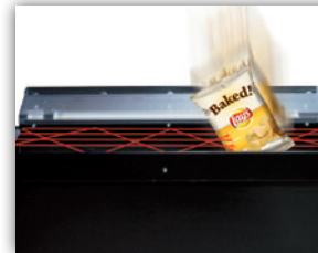
iVend® Guaranteed Delivery System

Keeps customers satisfied and reduces service calls for misloaded product.