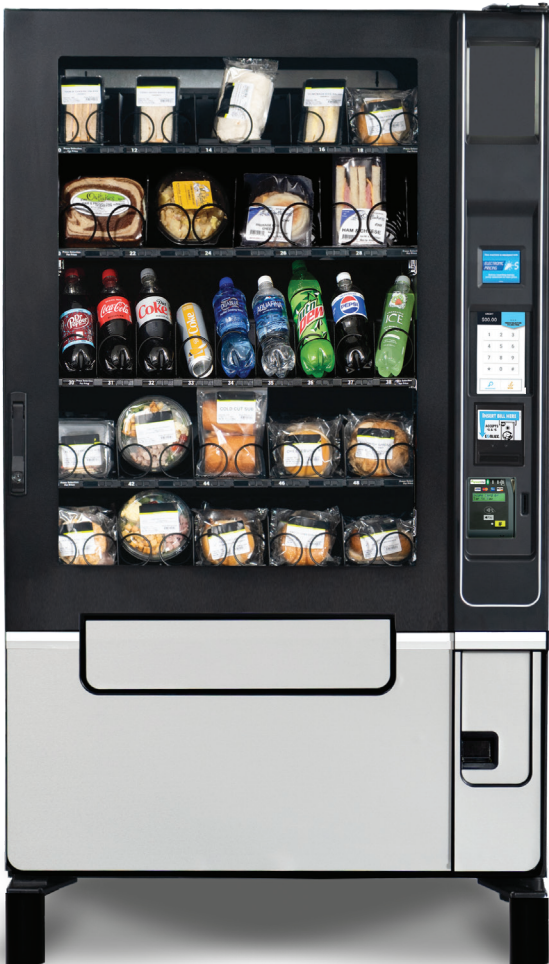
Shown with 7" Touch Screen Upgrade