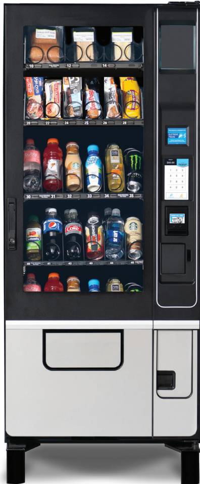
Shown with 7" Touch Screen Upgrade